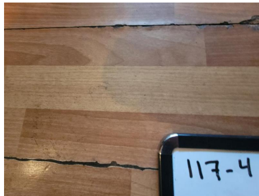
117-4 Laminate Flooring Interior Kitchen