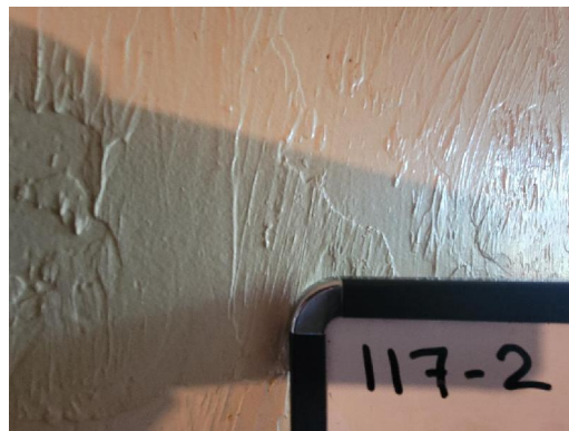
117-2 Drywall/Joint Compound Typical Interior Walls/Ceilings