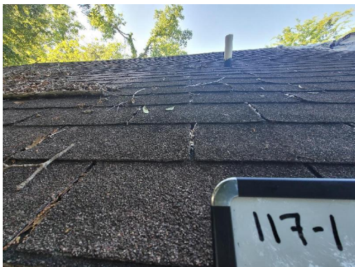
117-1 Asphalt Shingle/Tar Typical Exterior Roof