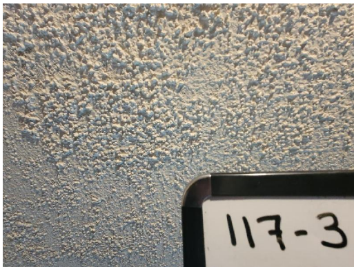
117-3 Popcorn Texture Typical Interior Ceilings